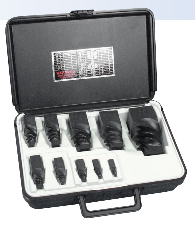
SET No. 210 shown

860-523-5231 • Fax: 860-236-9968 • WaltonTools.com